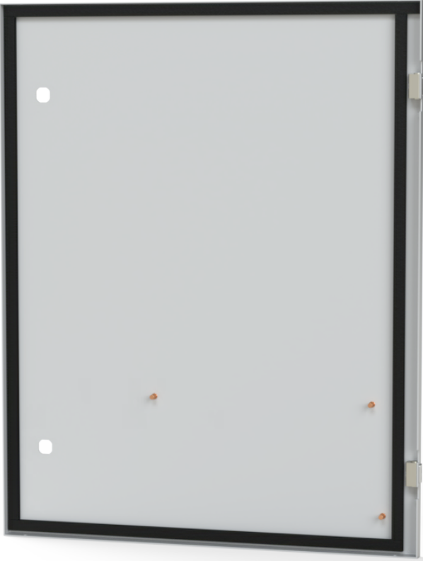
Door 3/4 view