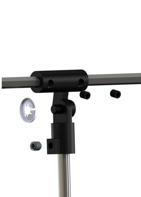
Detail A Exploded