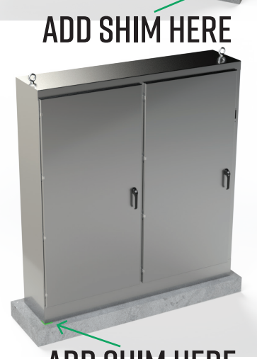
ADD SHIM HERE