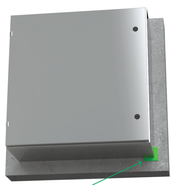
ADD SHIM HERE