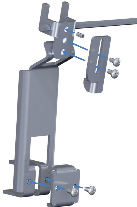
Detail C Exploded