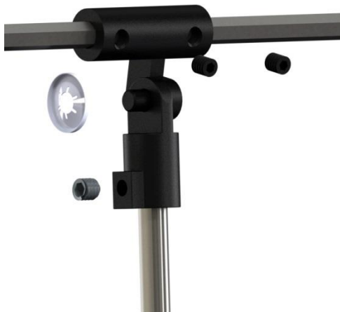
Detail A Exploded